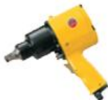
Regal Impact Wrench 3/4" (Pin Clutch)