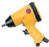
Regal Impact Wrench 1/2" (One Hammer)