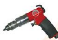
Regal Reversible Drill 1/4" Heavy Duty