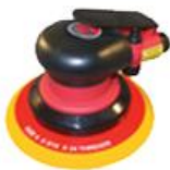
Regal Orbital Sander 5" Non-Vac 12,000rpm