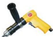
Regal Reversible Drill 1/2"