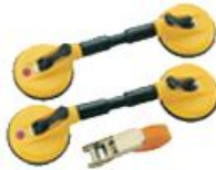
Regal Suction Cup With Belt (160kg)