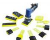
Regal Finger Sander Complete Set