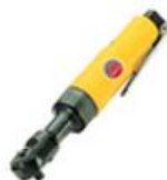
Regal 1/4", 3/8" Ratchet Wrench