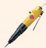
Regal Angle Screw Driver 1/4"