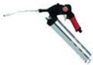
Regal Pneumatic Grease Gun