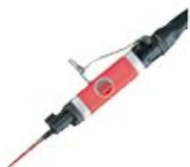
Regal Pneumatic Mini Body Saw