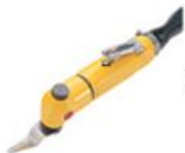
Regal Pneumatic Knife