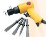
Regal Pneumatic Hammer 150mm