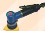
Regal Air Triangle Sander