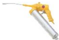
Regal Pneumatic Grease Gun