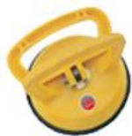
Regal Suction Cup (40kg)