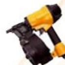
Regal Coil Nailer