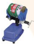
Regal Paint Shaker