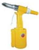
Regal Pneumatic Riveter 5/32", 3/16"