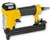
Regal Pneumatic Stapler