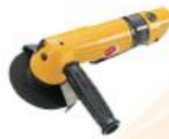
Regal 1/4" Die Grinder