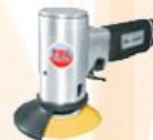
Regal Orbital Sander 3" Non-Vac 16,000rpm