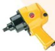
Regal Impact Wrench 3/4" (Twin Hammer)