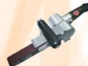
Regal Belt Sander 30x540mm