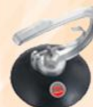
Regal Suction Cup (20kg)