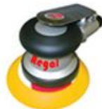
Regal Orbital Sander 5" Non-Vac 10,000rpm