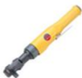
Regal 1/2" Ratchet Wrench Heavy Duty