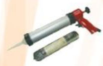
Regal Pneumatic Caulking Gun