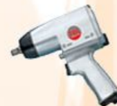
Regal Impact Wrench 1/4" (Pin Clutch) Handle Exhaust