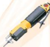
Regal Pneumatic Body Saw