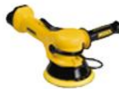
Mirka Two-Handed Random Orbital Sanders