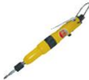
Regal Angle Screw Driver 1/4"