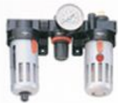
Regal Air Control Unit