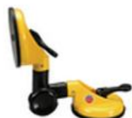
Regal Angle Suction Cup (80kg)