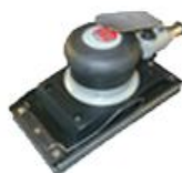
Regal Orbital Sander 185x95mm