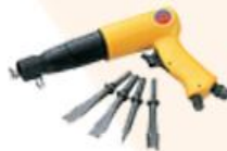
Regal Pneumatic Hammer 230mm