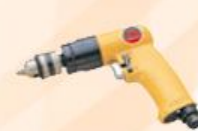
Regal Reversible Drill 3/8" Heavy Duty