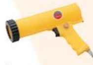
Regal Pneumatic Caulking Gun