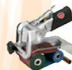
Regal Belt Sander 60x260mm