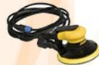
Mirka Electric Orbital Sander