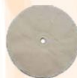
Loose Cloth Buff